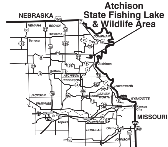
General Area Map

Equal opportunity to participate in and benefit from programs described herein is available to all individuals without regard to race, color, national origin, sex, age, disability, sexual orientation, gender identity, political affiliation, and military or veteran status. Complaints of discrimination should be sent to Office of the Secretary, Kansas Department of Wildlife, Parks and Tourism, 1020 S Kansas Ave., Topeka, KS 66612-1327. 09/12